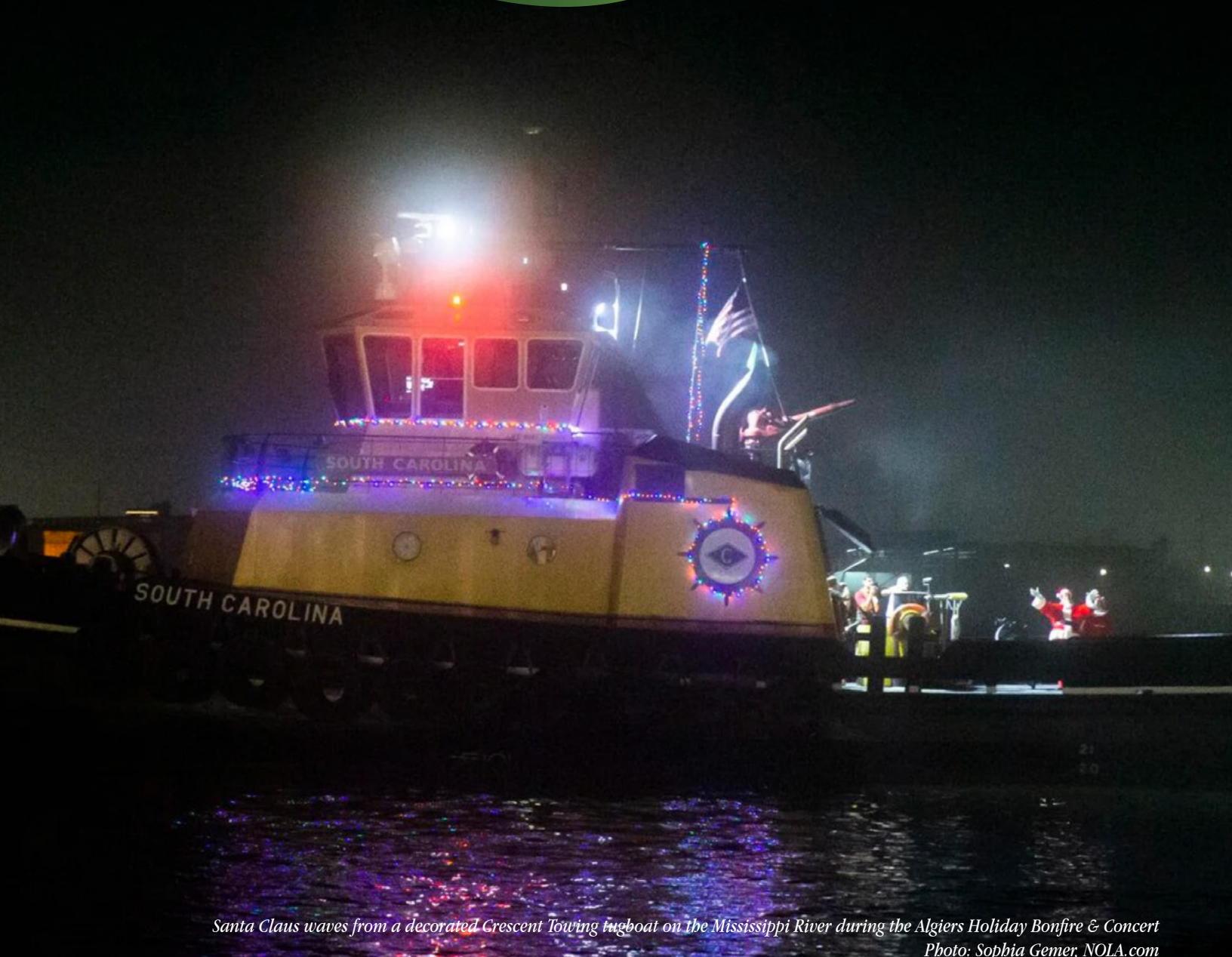
Santa Claus waves from a decorated Crescent Towing tugboat on the Mississippi River during the Algiers Holiday Bonfire & Concert