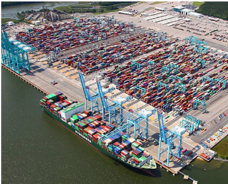
Port of Virginia